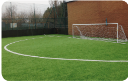
The new astro pitch surface

We are pleased to report that an application to the Big Lottery Fund has been successful and has enabled us to resurface the astro pitch adjacent to the Clubhouse. Our members have first priority to use the pitch, but the quality of the new surface means that we can now hire out the pitch when the Club is otherwise closed.