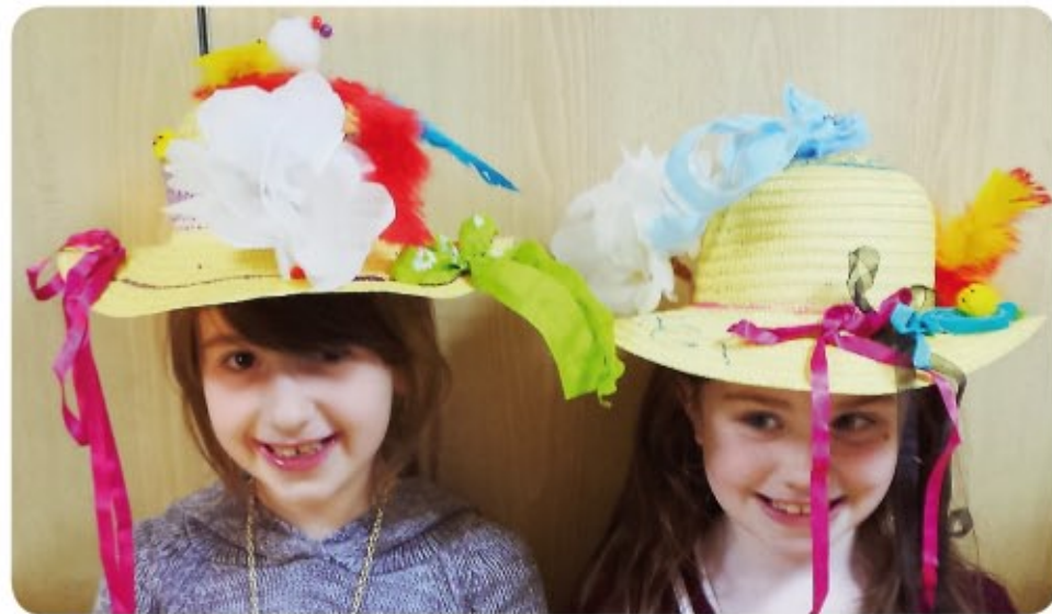
Colourful Easter bonnets being modelled by their proud creators

The youngsters were busy recently creating colourful Easter hats, pillows and other fantastic artistic creations.