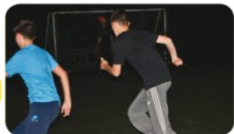
LADS Project members getting involved

A key feature of the project is that different agencies meet and work together to support the young men. The project is concerned with low-level safeguarding and targets those considered likely to benefit. Weekly sessions in the Club include discussing risk-taking behaviours and healthy lifestyles, with practical activities to engage the members. The culmination of the project was a two-night residential event where all the participants came together at the Oaklands outdoor pursuits centre in North Wales.