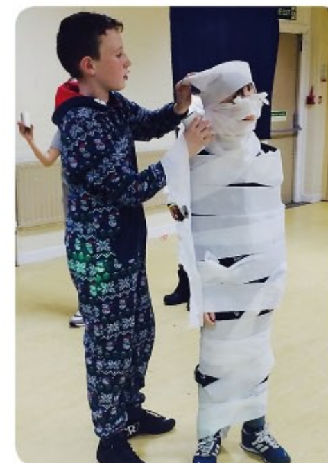
Mummy construction in progress

At the Christmas party the most popular game of the evening was the 'create an Egyptian mummy' competition.