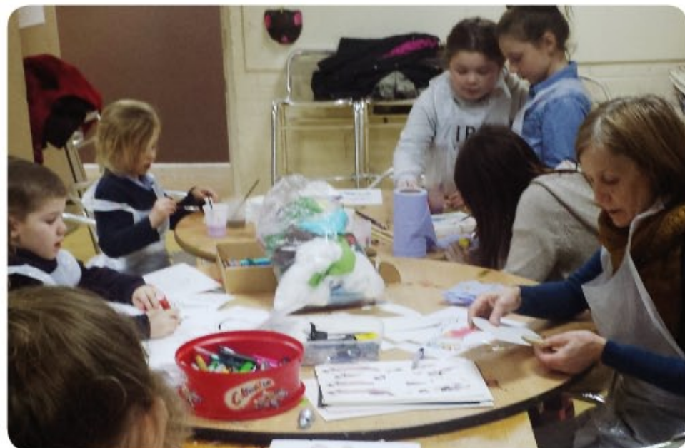
The talented Art Club hard at work on their latest masterpieces