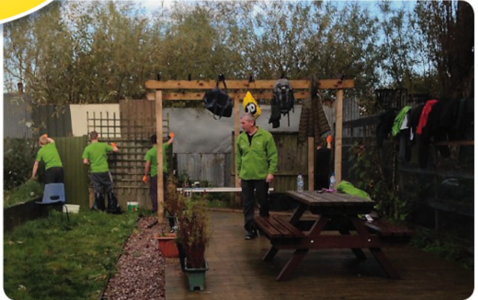
Scottish Power volunteers working hard on the Shaftesbury Youth Club allotment