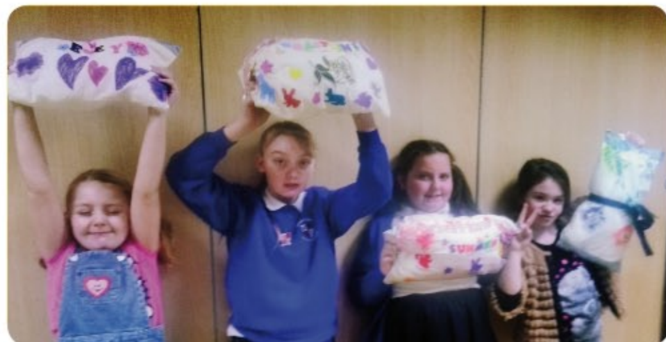
The pillow artists exhibit their cool and colourful creations