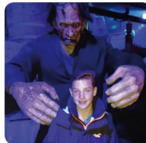
Frankenstein had his hands full at Farmageddon