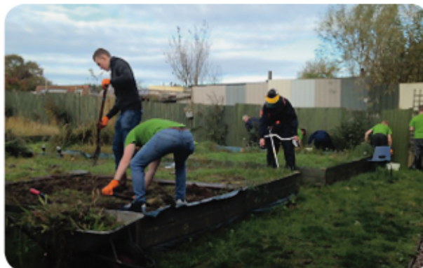
Scottish Power helpers digging in on the allotment plots

Vegetable beds need to be cleared and the allotment tidied after cropping; given the size of our plot this is quite a task. Our need for willing workers coincided with Scottish Power's community volunteer programme for its apprentices. Twenty-five young people worked solidly all day on 24th October preparing the allotment for winter and the 2015 season. This was a very successful and good-natured day. Thank you to everyone who has worked so hard to make the allotment so productive!