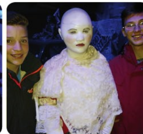
Spooky masks cause Halloween scares